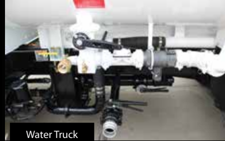
Water Truck Features