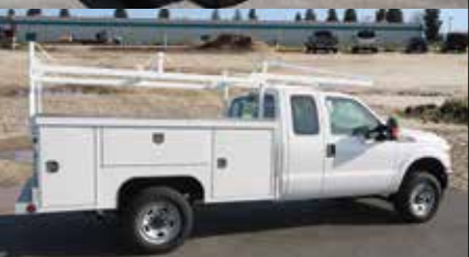
Service Body - Crown Series Standard