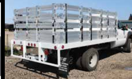
Flatbed/Platform with Side Racks (aluminum shown here)