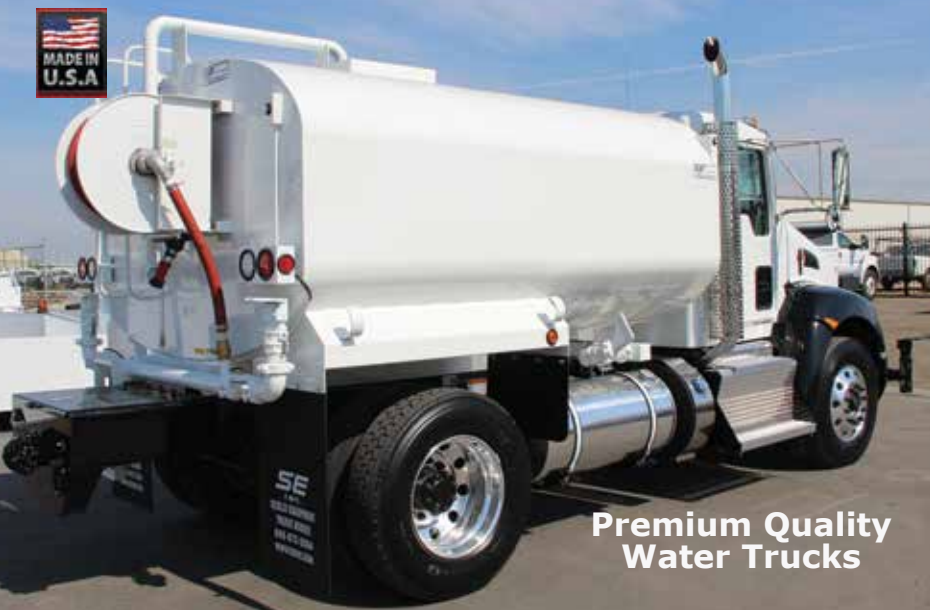
Premium Quality Water Trucks