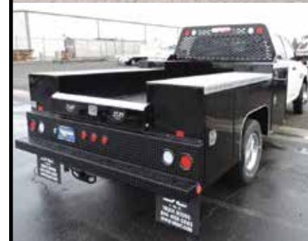
Crown RV "Hauler" Body

Every SCELZI Truck Body Is Precision Engineered To Match The Professional In The Driver's Seat