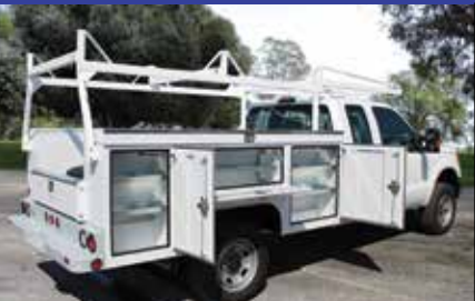
Service Body - Signature Series Premium

Every SCELZI Truck Body Is Precision Engineered To Match The Professional In The Driver's Seat