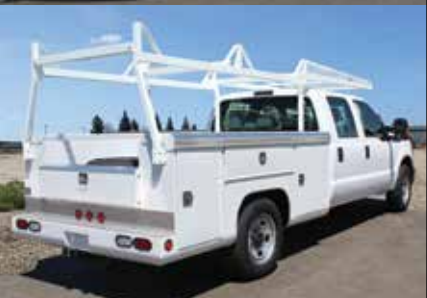
Service Body - Contour Style Elite